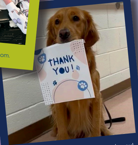
Jimmy, The Larc School family dog Thanks you!