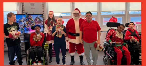
Room 12 enjoyed a visit from Santa Claus.

Throughout the season, students immersed themselves in every way possible, exploring holiday sights, sounds, and textures by ripping wrapping paper, shaking jingle bells, and sorting ornaments, and always welcoming magical stops by Santa himself.